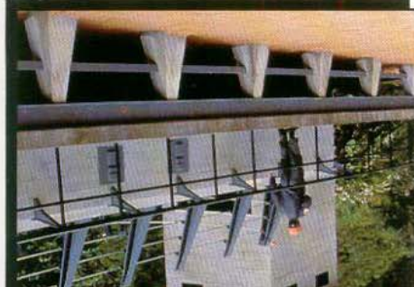
The Velociraptor pen

The elaborate control mechanisms of Jurassic Park, which are imperative to protecting both the guests and the inhabitants, are currently being installed. Chief Engineer John Arnold and Director of Computer Technologies Dennis Nedry are busy working out the bugs prior to the June 11 grand opening.