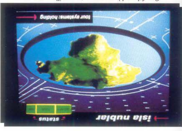
One of the park's many computer surveillance screens

If you're wondering where John Hammond found the name for his unique amusement park, take a look into the prehistoric past... The Mesozoic Era, the period of time from 225 to 64 million years